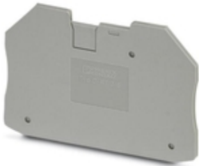
End cover, length: 65 mm, width: 2.2 mm, height: 50.4 mm, color: gray

Please be informed that the data shown in this PDF Document is generated from our Online Catalog. Please find the complete data in the user's documentation. Our General Terms of Use for Downloads are valid ( http://phoenixcontact.com/download )